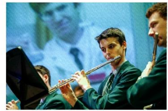
Students performing on stage during the Villa Music Festival. The festival is a great way to celebrate the arts and to build a sense of community.

The festival will be held at the Villa Campus and will feature a variety of performances and workshops. Students are encouraged to participate in the festival and to bring their friends and family to support them.